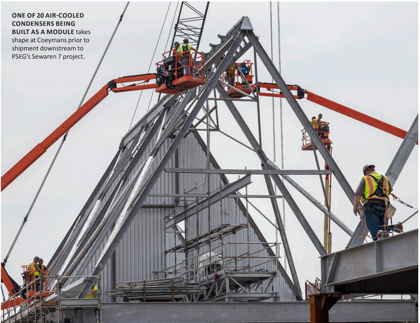
ONE OF 20 AIR-COOLED CONDENSERS BEING BUILT AS A MODULE takes shape at Coeymans prior to shipment downstream to PSEG's Sewaren 7 project.

ules. Crews also constructed sections of the plant's stack along with other assemblies. Some 150 Boilermakers were employed on the project at peak, according to L-5 Z197 ABM William Bailey.