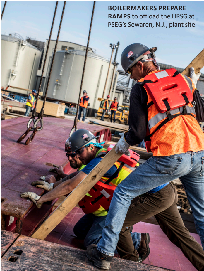
BOILERMAKERS PREPARE RAMPS to offload the HRSG at PSEG's Sewaren, N.J., plant site.

Crowds gathered along parts of the route to witness the HRSG's trip, waving and shouting "USA!" as the barge passed. A large banner draped across the HRSG proclaimed "Union Built in the USA," advertising the partnership of union labor, the owner and the primary contractors.