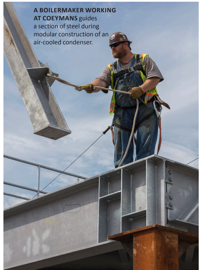
A BOILERMAKER WORKING AT COEYMANS guides a section of steel during modular construction of an air-cooled condenser.

Boilermakers Local 5 Zone 197 (Albany, New York) led the union craft work on the HRSG and 20 air-cooled condensers, which were shipped separately in mod-