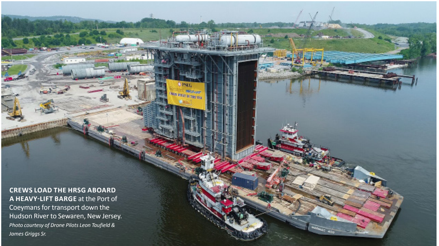
CREWS LOAD THE HRSG ABOARD A HEAVY-LIFT BARGE at the Port of Coeymans for transport down the Hudson River to Sewaren, New Jersey.