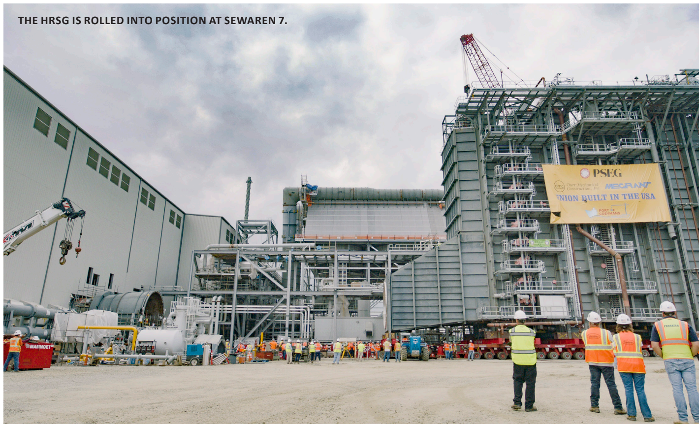
THE HRSG IS ROLLED INTO POSITION AT SEWAREN 7.